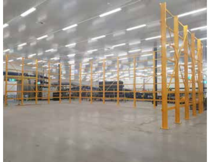
ULD Storage solution 1.5m-5.5m high