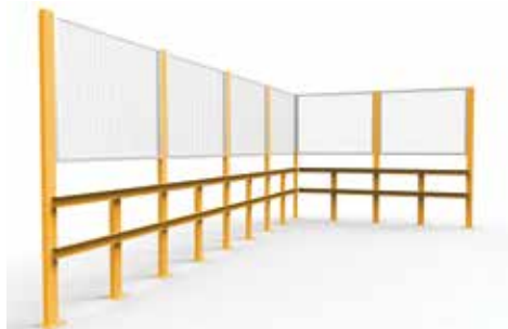
Verge Hy-Wall Rail Mesh Combi 3.6m high