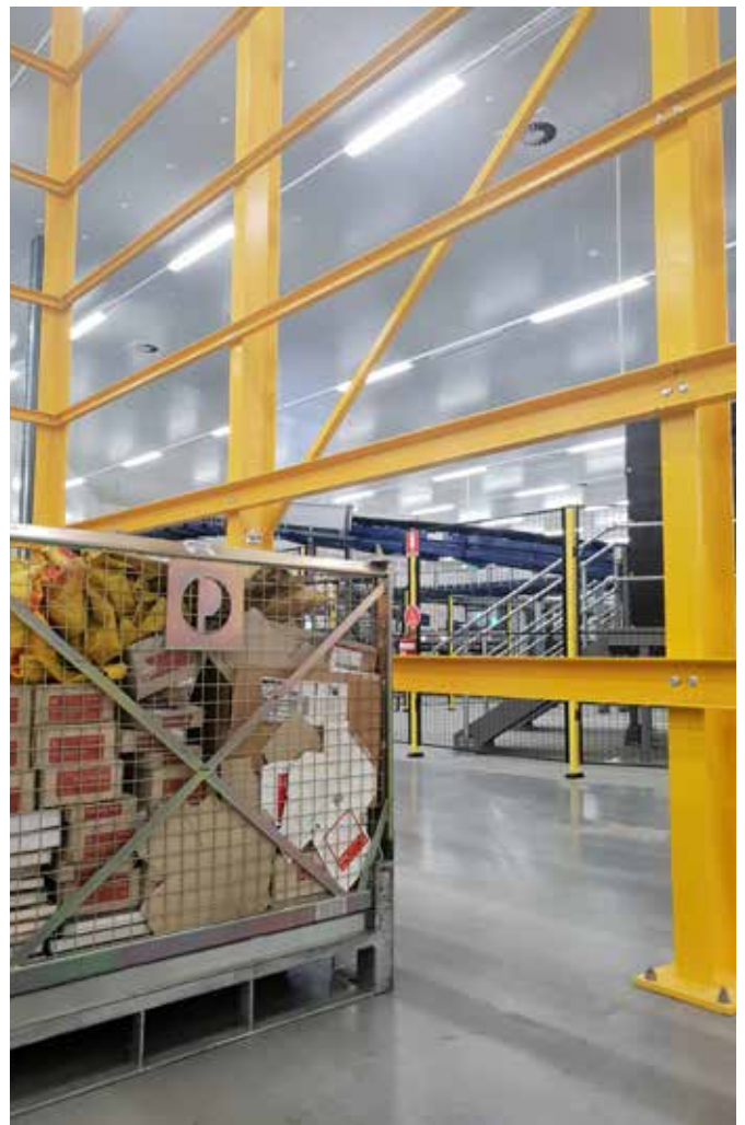
Aust Post are enjoying the safe solution for the storage of their ever growing ULD storage requirements