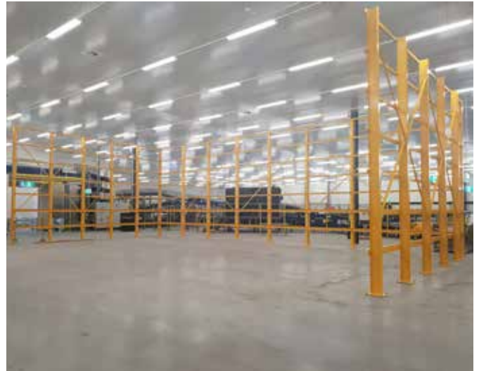
ULD Storage solution 1.5m-5.5m high