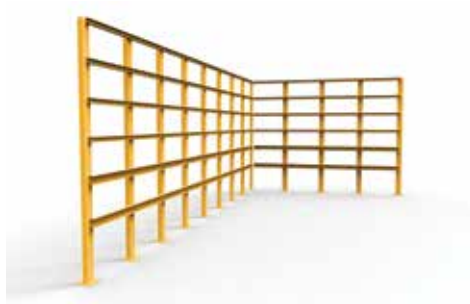
Verge Hy-Wall Rail Option 3.6m High